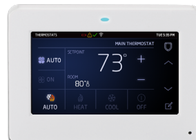
7872-W | 7873-W | 9862-W | 9862USB-W