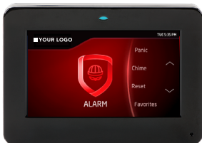
7872-B | 7873-B | 9862-B | 9862USB-B

800-641-4282 | DMP.com 2500 N. Partnership Blvd, Springfield, MO 65803 Designed, engineered & manufactured in Springfield, MO using U.S. & global components